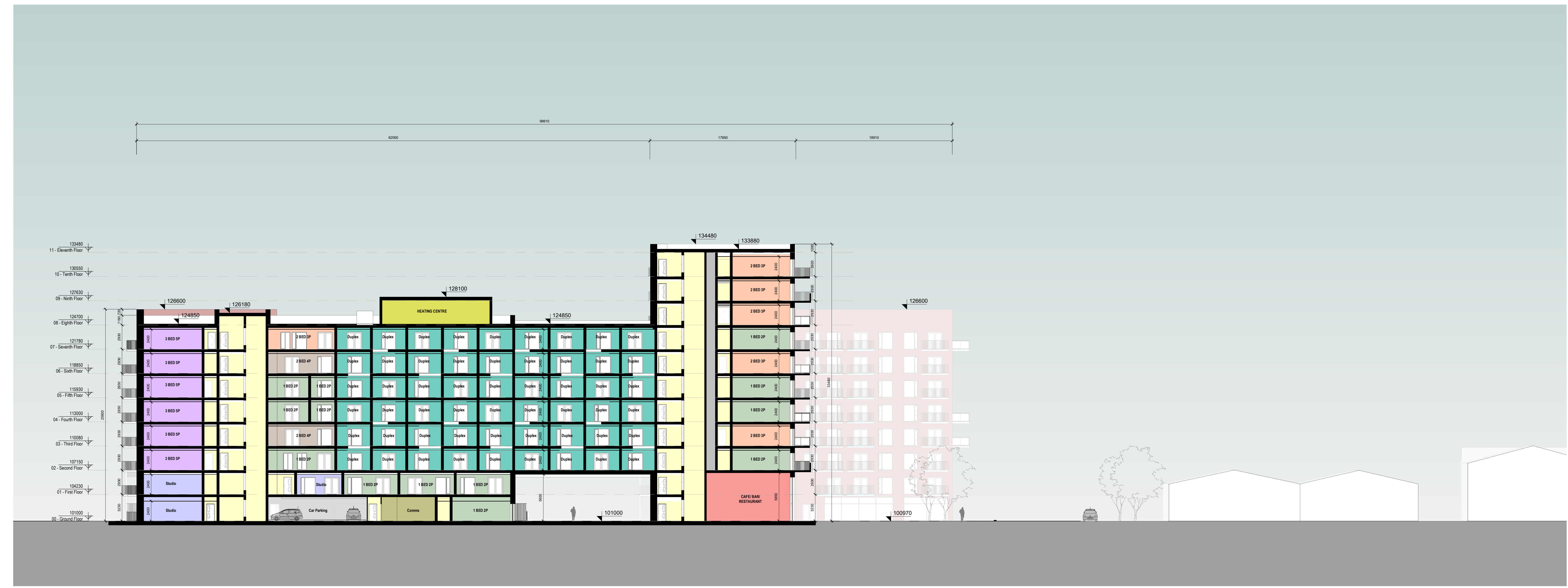
B1 Block B - Section B1 1:200